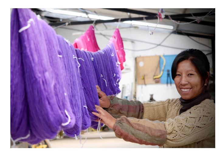
Suritex, a social enterprise that increases the earnings of alpaca producers in Peru, received a loan from NESsT in 2016 after successfully completing the organization's new investment process.

Due diligence is conducted by NESsT, including interviews and site visits, concluded with an investment memo written by the NESsT portfolio team, based on the information provided by the social enterprise management team. It includes historical results and three to five years of business and financial projections. Official financial statements and other funding agreements are required and analyzed.