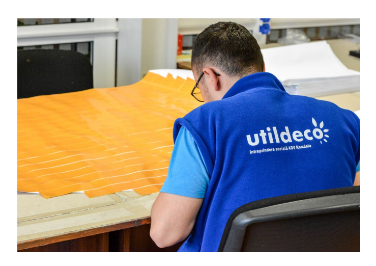
Alaturi de Voi, a Romanian foundation in Iași, Romania, runs a social enterprise to train and employ youth with HIV/AIDS.

EcoHerbal, Iluminis, Made in Rosia Montana, Mai Bine-CUIB, Motivation, Timural and Viitor Plus. For more information on these enterprises, please <a href="https://www.nesst.org">www.nesst.org</a>.