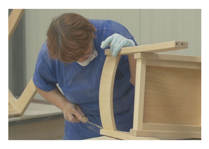
Timural Group is a social enterprise in Mureş, Romania, that manufactures and sells educational toys and small wooden furniture.

As per a research study performed in Romania by the Institute of Social Economy and Eurom<sup>12</sup> in April 2016, 10% of the 34 social enterprises surveyed already had a bank loan and 2% tapped into microcredit opportunities. While more than 50% of them would be interested in taking a loan in the future, most of them expressed needing technical assistance and consulting services before doing so. Unfortunately, there are no other reliable national statistics on the number of social enterprises taking loans or using non-grant type of instruments in the country.